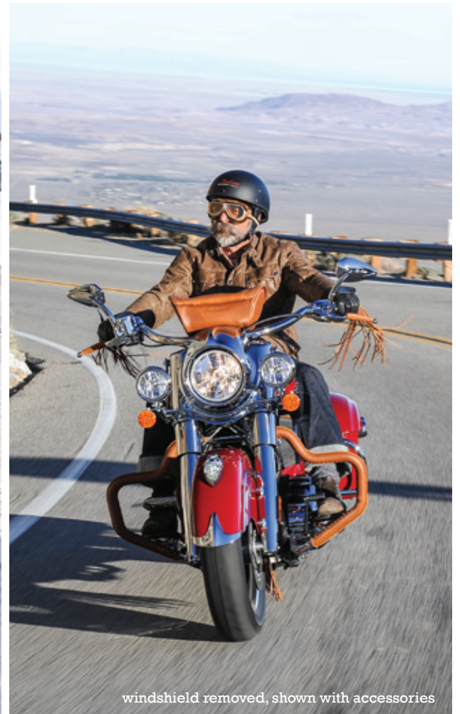
windshield removed, shown with accessories