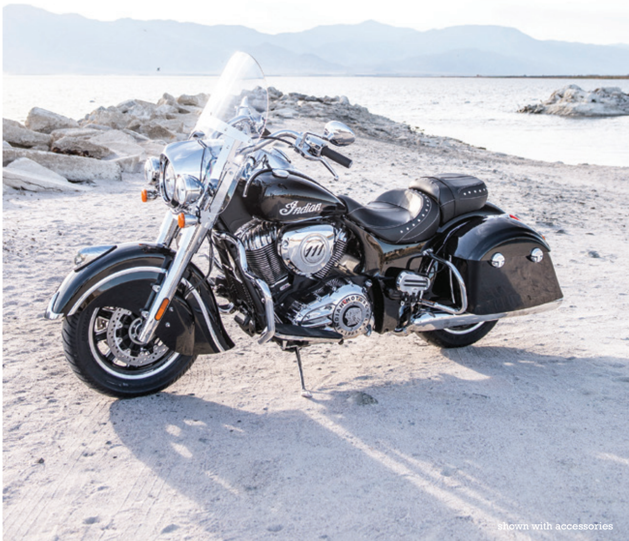
shown with accessories